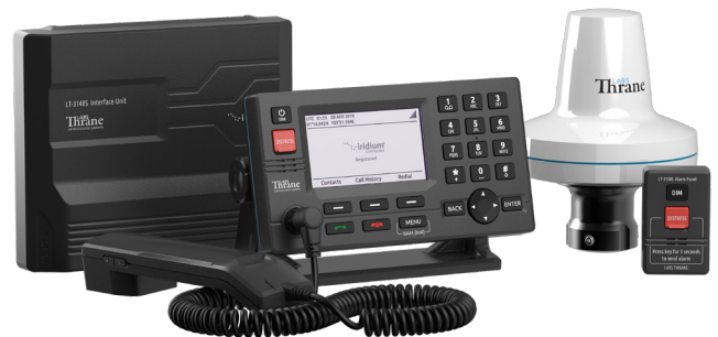
Lars Thrane LT-3100S